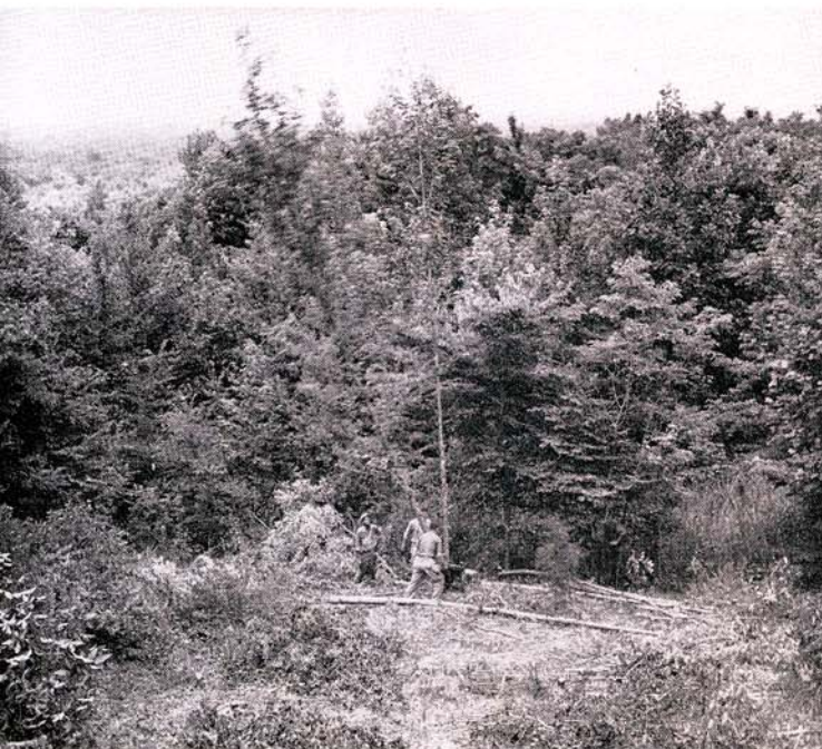
Harvesting forest land is a good way to add to your income. Here the GRAVELY Tractor with its Rotary Saw Attachment is felling slash pine for pulpwood. Notice the size of the tree being felled, and that the Saw goes to the job!

You bring new land into productive pasture or crop land easily, quickly and economically with the new GRAVELY Rotary Saw Attachment! One man, with this power-driven Saw clears land of brush and filth, cuts sprouts, weeds, saplings or trees, anything up to 18 inches through, in an amazingly short time compared to hand methods.