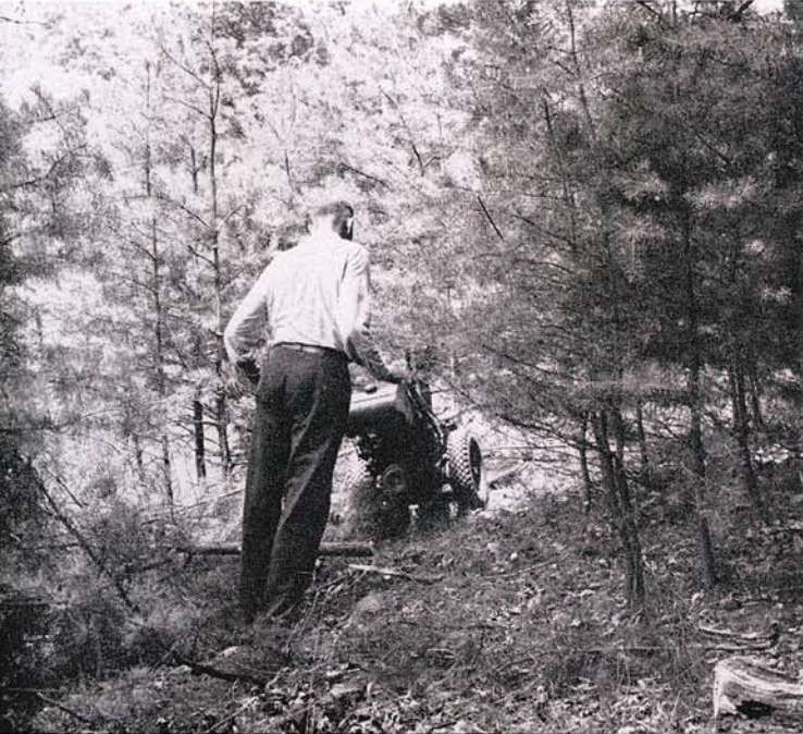
Clearing land is quick and inexpensive with the GRAVELY Rotary Saw Attachment. Merely put the Saw in the horizontal position, put the tractor and attachment in gear and guide the machine—POWER does the work.