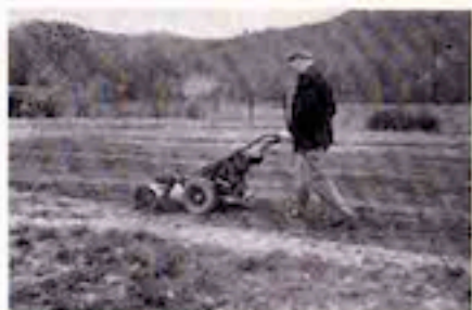
Getting the ground ready for planting

Let us show you the Gravelly Rotary Cultivator . . . at no cost or obligation. See for yourself, on your own ground, how easy and convenient this Gravelly tool makes your gardening!