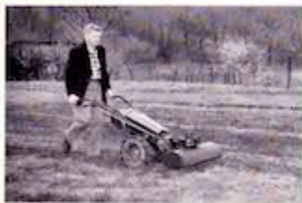
Mulches as it cultivates

Yes—new ease, new convenience in your garden work. . . never before has gardening been so easy!