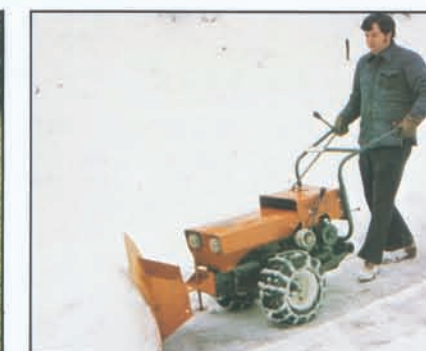
Model 88E with Model 891