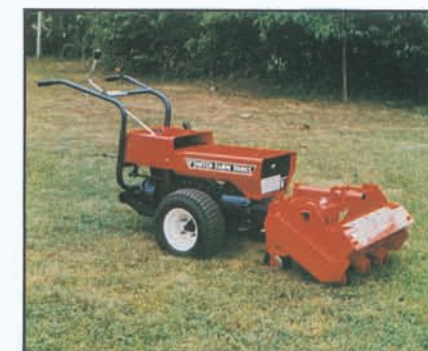
Models 88R with Model 888