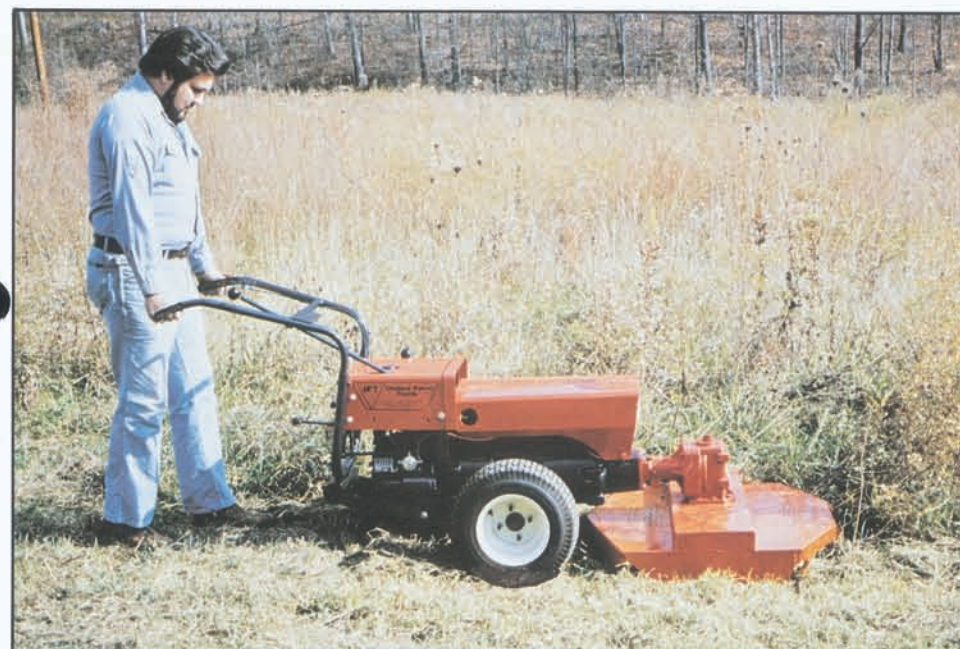
Model 88E with Model 883