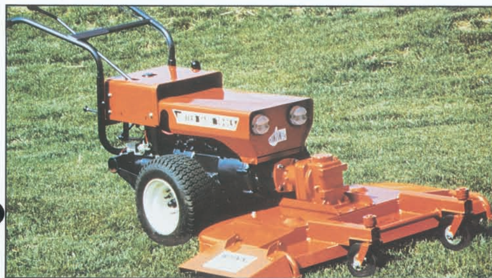
Model 88E with Model 884