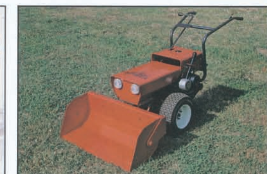
Model 88E with Model 893