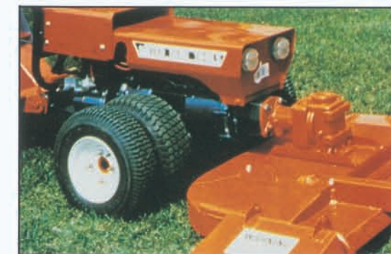
Model 88E with Model 882