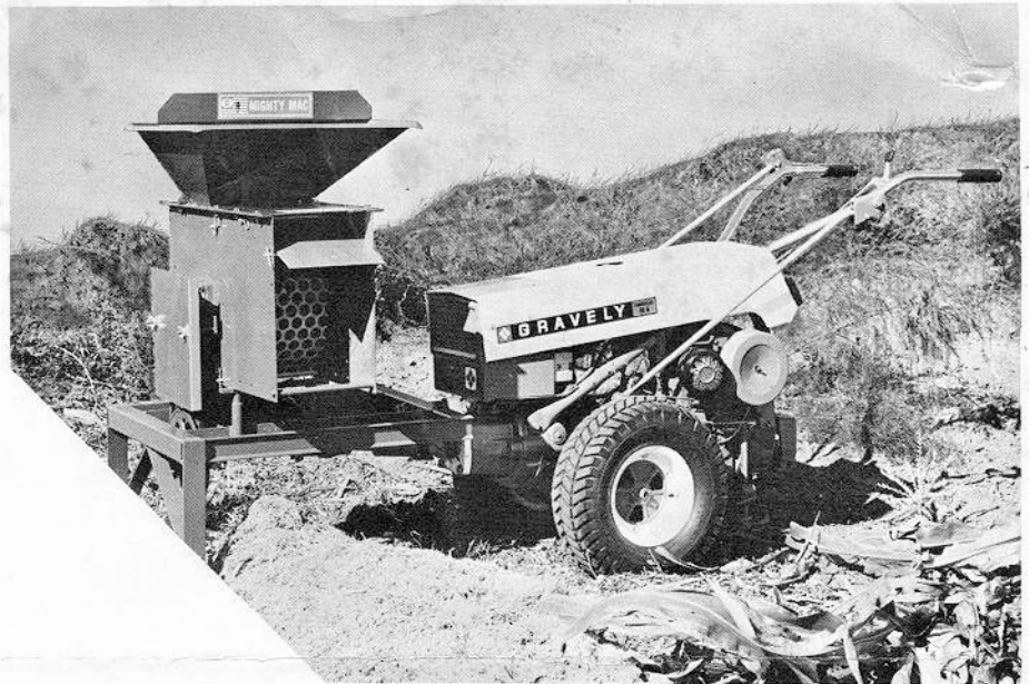
MODEL 9-GC (Convertible)

The Mighty Mac 9-GC is available for mounting to all Gravelly two wheel Convertible tractors. Requires quick hitch kit 11898E1, available from your Gravelly dealer. The 9-GC has the same quality features and rugged versatility as the 9-G or self powered 9-P. Twenty-four (24) free swinging hammers do the grinding or shredding.