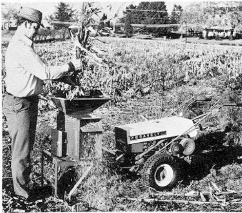
Model 9-GC—grind or shred corn stalks, leaves, vines, manure, straw, newspaper and more.

The front end of the shredder frame is supported by steel skids. The shredder attaches to your convertible quickly and easily, supported on a taper pin and driven by a universal jointed PTO shaft.